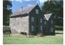
Clun Mill YHA